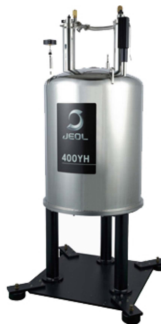
Fig. 1. (Color online) The 400 MHz FT-NMR spectrometer that was used in this study.

^{19}\text{F} NMR spectroscopy measurements were carried out with an ECZR NMR spectrometer (400 MHz FT-NMR spectrometer, JNM-ECZ400S/L1, JEOL Ltd., Tokyo, Japan) operating at 376.17 MHz and equipped with a dedicated 5 mm spinning probe (Fig. 1). The probe temperature was 23 °C. The typical spectral parameters for this study were